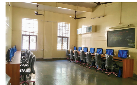
Our brand new Computer Lab sponsored by Quantum Advisors