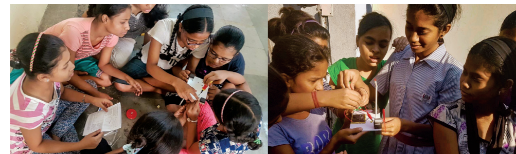
Introducing the latest STEAM Learning Programme. Energized and engaged, the girls built a model that explained the concept of electricity and solar energy.