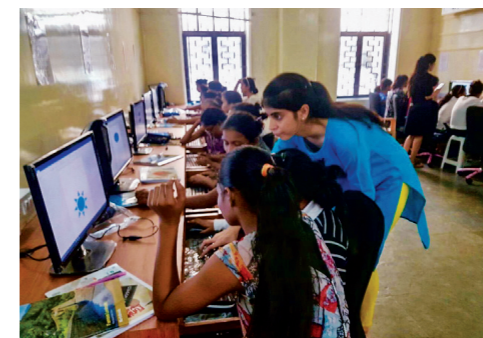
Digital literacy is the need of the hour and it is our endeavor to bring our girls up to speed with the latest advances in technology.